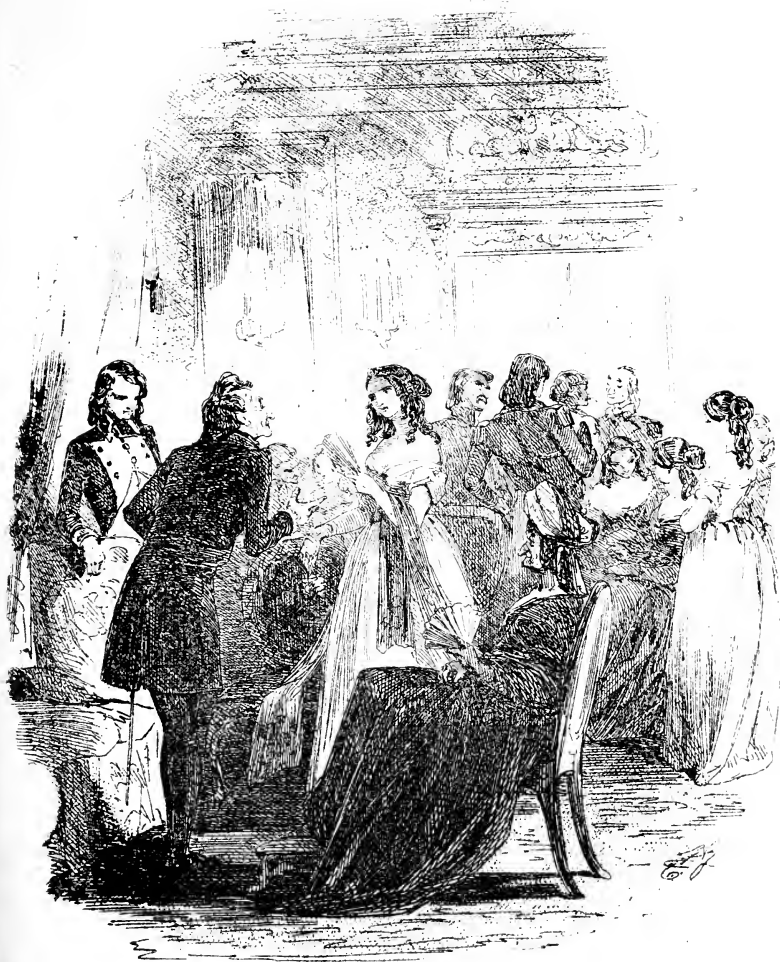
The Rose of Provence.